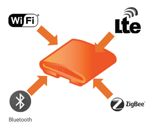
Figure 3. Consolidated wireless standards