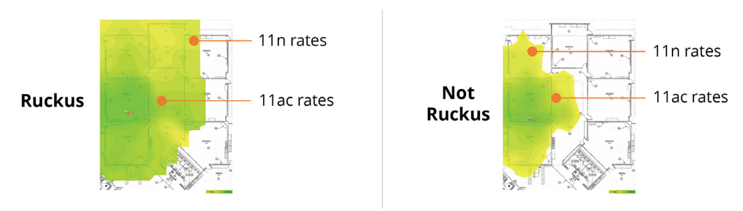
Figure 4. BeamFlex adaptive antennas

Traditional APs use "omnidirectional" antennas that radiate signals in all directions. Conversely, RUCKUS BeamFlex+ adaptive antennas allow CommScope APs to dynamically choose among a host of antenna patterns (over 4,000 possible combinations) in real time to establish the best possible connection with every device. BeamFlex+ works on a per-packet basis to optimize the user experience. In addition, BeamFlex+ uniquely supports mobile devices by adapting antenna transmissions to a device's orientation in both vertical and horizontal axes through our PD-MRC technology.